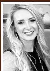
Freya Jensen Industrial Systems & Fabrications