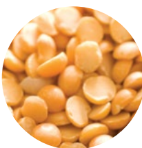
Yellow Split Peas