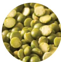
Split Green Peas