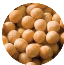
Yellow Whole Peas