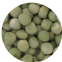
Whole Green Peas

The two most common varieties of dry peas are green and yellow peas. Split peas are simply dry peas (green, yellow or red) that have been split. Green split peas have a stronger flavor than yellow split peas, which have a milder, slightly sweet flavor.